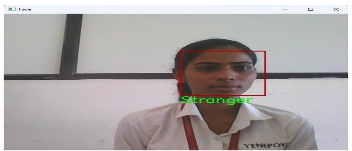
Figure5: Image of detector dataset

A trainer dataset is a collection of input data, along with the corresponding output labels or target values, that is used to train a model. By exposing the model to a diverse range of labelled examples during training, it learns to identify patterns and relationships in the data, and adjust its internal parameters to make better predictions on new, unseen data.