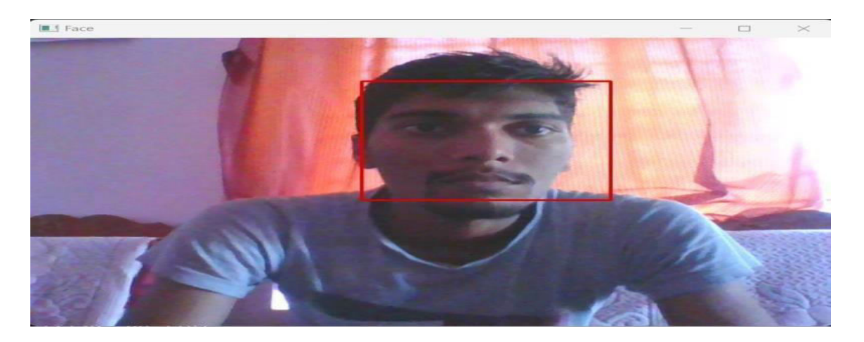
Figure 3: Dataset creator

Figure (a) shows the creating an user account and figure (b) shows how to login into user account.